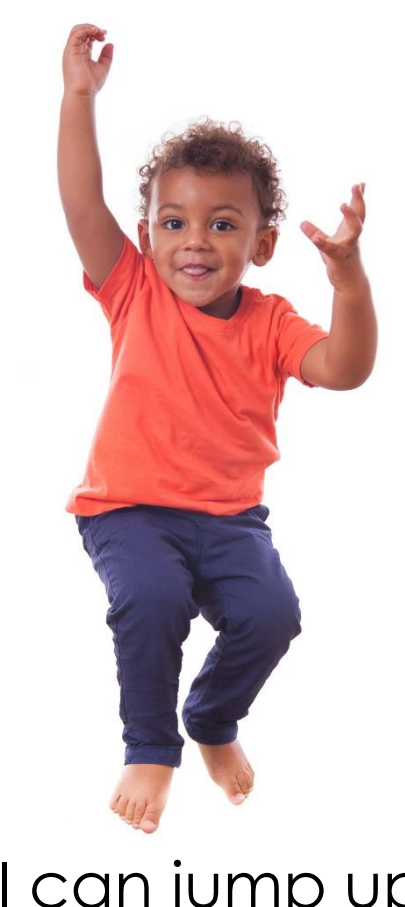
I can jump up and down.