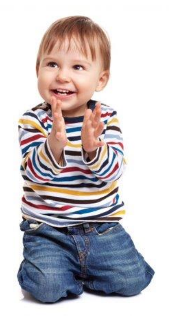
Excited is when you are REALLY happy!