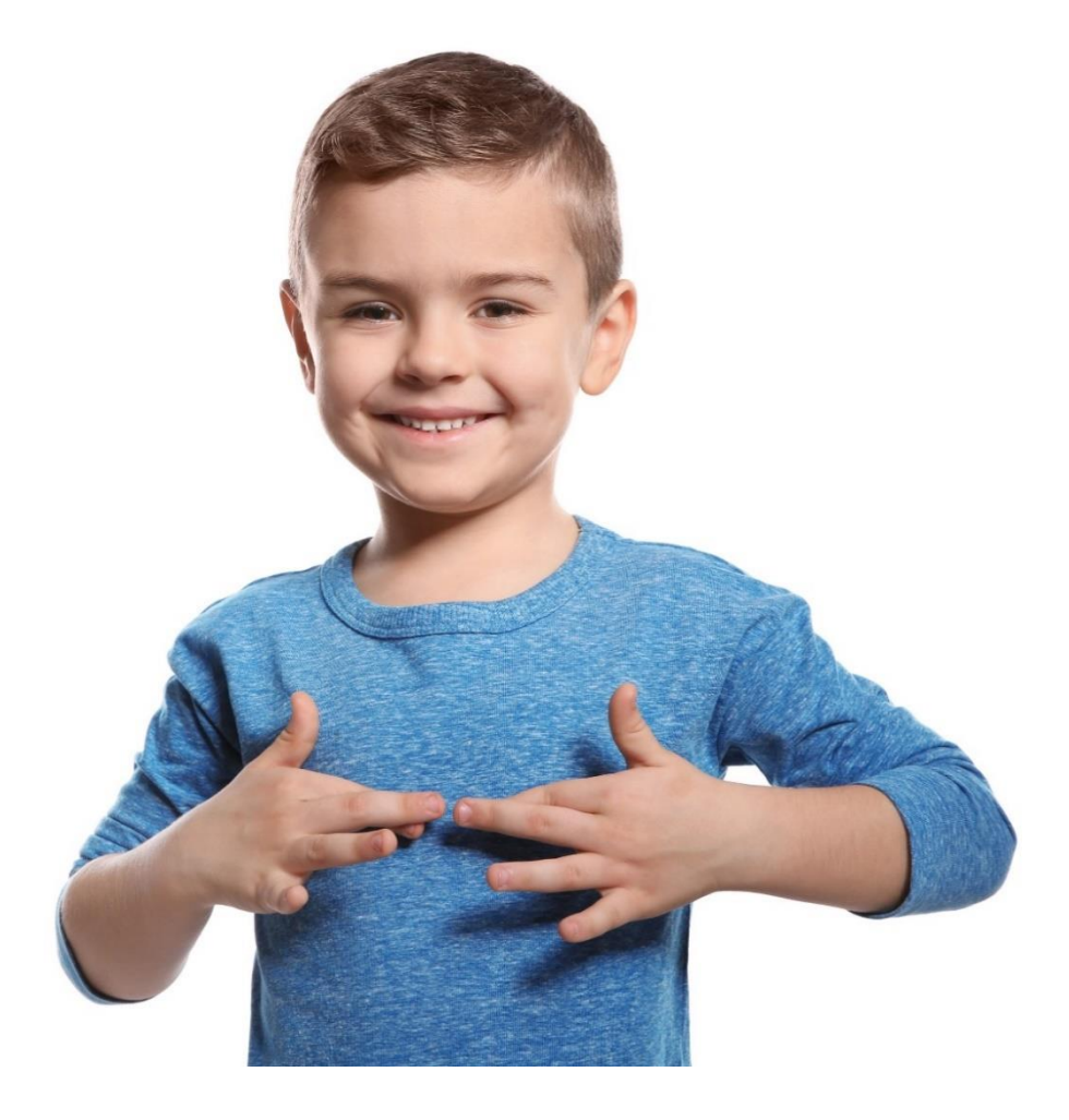
I can tell people, "I'm so excited!"